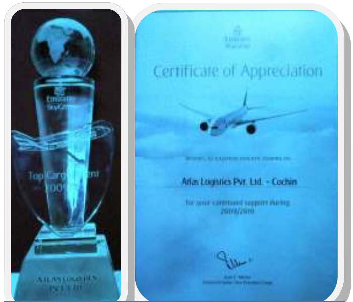
Atlas Cochin have obtained Gold medal for the best cargo agent for the year 2009-10 from Gulf Air and Emirates . "Congratulations Cochin Team"