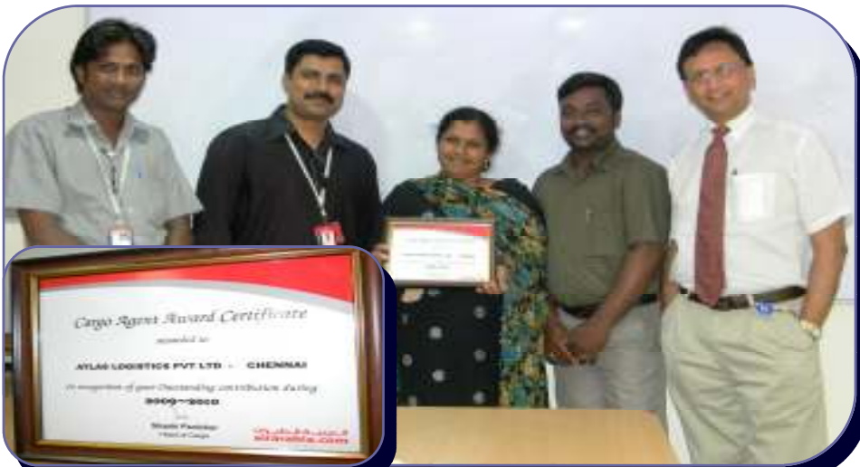
Atlas Chennai obtained Outstanding performance award 2009-2010 from Air Arabia. "Congratulations Chennai Team"